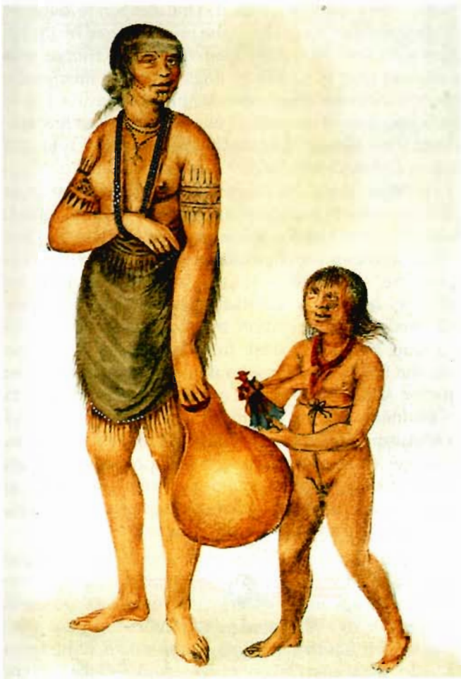
A Carolina Indian Woman and Child, by John White The artist was a member of the Raleigh expedition of 1585. Notice that the Indian girl carries a European doll, illustrating the mingling of cultures that had already begun.

They were again defeated. The peace treaty of 1646 repudiated any hope of assimilating the native peoples into Virginian society or of peacefully coexisting with them. Instead it effectively banished the Chesapeake Indians from their ancestral lands and formally separated Indian from white areas of settlement—the origins of the later reservation system. By 1669 an official census revealed that only about two thousand Indians remained in Virginia, perhaps 10 percent of the population the original English settlers had encountered in 1607. By 1685 the English considered the Powhatan peoples extinct.