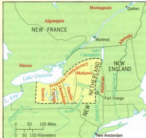
Iroquois Lands and European Trade Centers, c. 1590–1650

The building block of Iroquois society was the longhouse (see photo p. 41). This wooden structure deserved its descriptive name. Only twenty-five feet in breadth, the longhouse stretched from eight to two hundred feet in length. Each building contained three to five fireplaces around which gathered two nuclear families, consisting of parents and children. All families residing in the longhouse were related, their connections of blood running exclusively through the maternal line. A single longhouse might shelter a