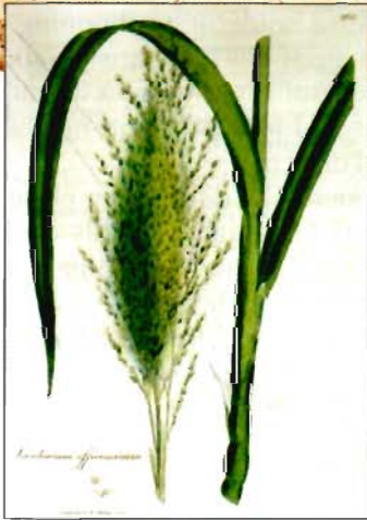
(above) Sugar Mill in Brazil, by Frans Post, c. 1640 (left) Saccharum Officinarum (sugar cane)

To control this large and potentially restive population of slaves, English authorities devised formal “codes” that defined the slaves’ legal status and masters’ prerogatives. The notorious Barbados slave code of 1661 denied even the most fundamental rights to slaves and gave masters virtually complete control over their