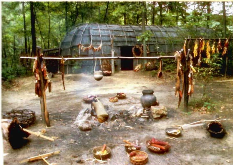
The Longhouse (reconstruction) The photo shows a modern-day reconstruction of a Delaware Indian longhouse (almost identical in design and building materials to the Iroquois longhouses), at Historic Waterloo Village on Winakung Island in New Jersey. (The Iroquois conquered the Delawares in the late 1600s.) Bent saplings and sheets of elm bark made for sturdy, weather-tight shelters. Longhouses were typically furnished with deerskin-covered bunks and shelves for storing baskets, pots, fur pelts, and corn.

Reservation life proved unbearable for a proud people accustomed to domination over a vast territory. Morale sank; brawling, feuding, and alcoholism became rampant. Out of this morass arose a prophet, an Iroquois called Handsome Lake. In 1799 angelic figures clothed in traditional Iroquois garb appeared to Handsome Lake in a vision and warned him that the moral decline of his people must end if they were to endure. He awoke from his vision to warn his tribespeople to mend their ways. His socially oriented gospel inspired many Iroquois to forsake alcohol, to affirm family values, and to revive old Iroquois customs. Handsome Lake died in 1815, but his teachings, in the form of the Longhouse religion, survive to this day.