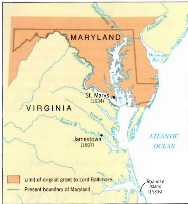
Early Maryland and Virginia

Absentee proprietor Lord Baltimore hoped that the two hundred settlers who founded Maryland at St. Marys, on Chesapeake Bay, would be the vanguard of a vast new feudal domain. Huge estates were to be awarded to his largely Catholic relatives, and gracious manor houses, modeled on those of England's aristocracy, were intended to arise amidst the fertile forests. As in Virginia, colonists proved willing to come only if offered the opportunity to acquire land of their own. Soon they were dispersed around the Chesapeake region on modest farms, and the haughty land barons, mostly Catholic, were surrounded by resentful backcountry planters, mostly Protestant. Resentment flared into open rebellion near the end of the century, and the Baltimore family for a time lost its proprietary rights.